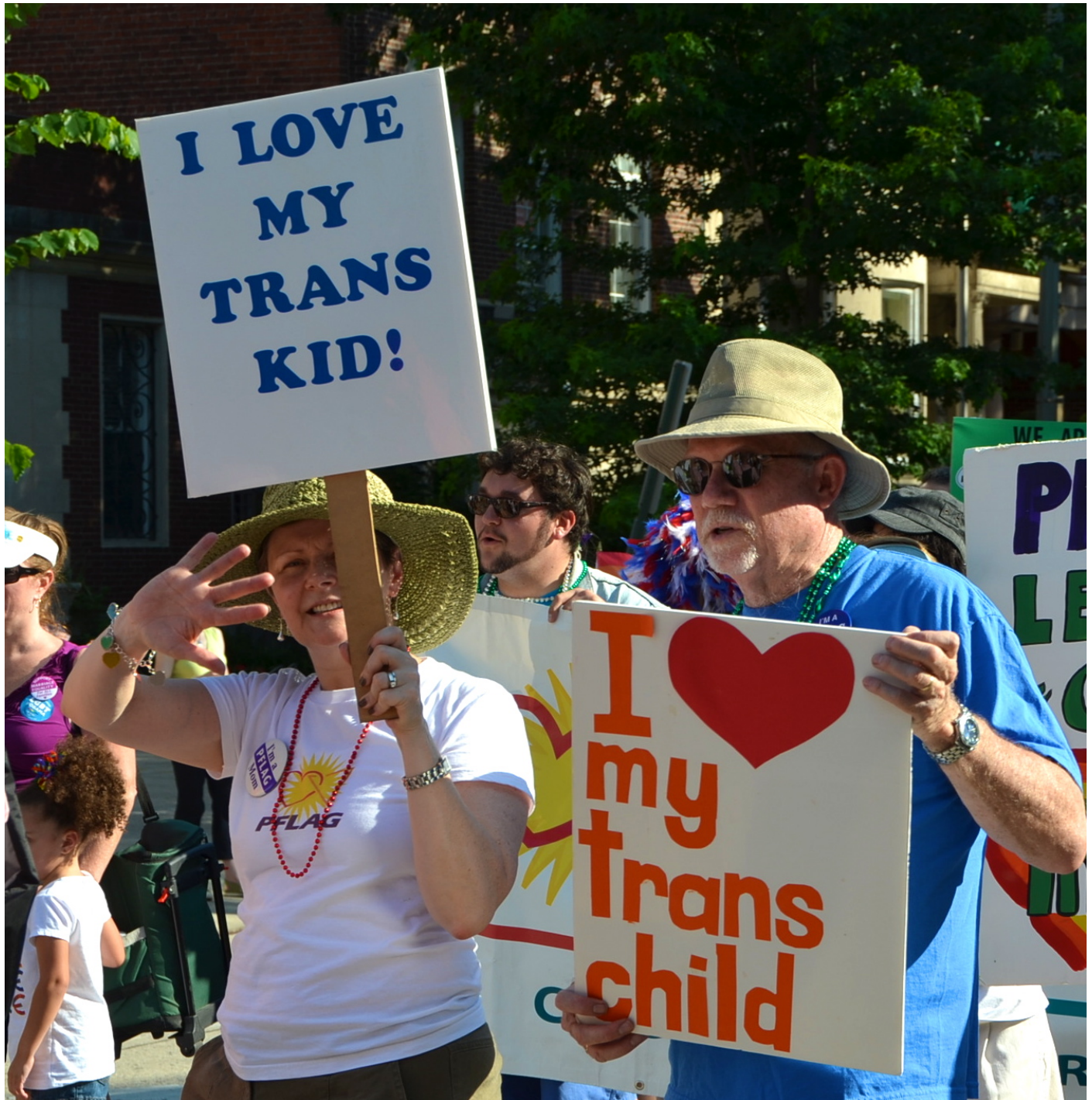
PFLAG members march in the 2012 Capital Pride parade. LGBTQ youth who report having at least one accepting adult in their lives were 40% less likely to report a suicide attempt in the past year, according to the Trevor Project's 2019 National Survey on LGBTQ Youth Mental Health.